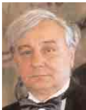
Professor Sergey Novikov

Member of Mathematical Sciences Committee