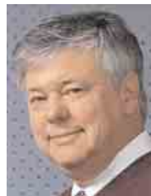
Professor Michael S. Brown

He has received numerous awards including the National Medal of Science.