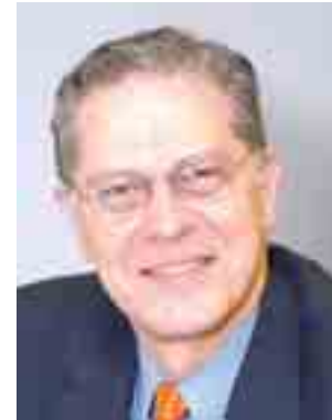
Professor Joseph Hooton Taylor

He has been primarily engaged in research in the fields of QSO absorption line, QSO survey, Galactic Physics and Large scale astronomy and is now the PI of the National Major Research Project (973 Project) : "The Galaxy Formation and Galactic Evolution"; he has also been in charge of key projects of the National Science Foundation.