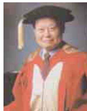
Professor Chen-Ning Yang

Professor Chen-Ning Yang, an eminent contemporary physicist, was Albert Einstein Professor of Physics at the State University of New York at Stony Brook until his retirement in 1999. He has been Distinguished Professor-at-large at the Chinese University of Hong Kong since 1986, and Ji-Bei Hoang and Kai-Qun Lu Professor at Tsinghua University, Beijing, since 2005.