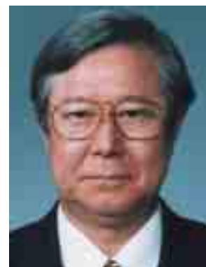
Professor Heisuke Hironaka