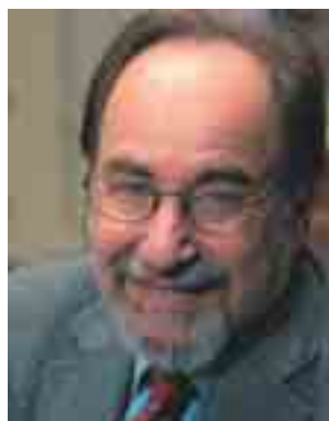
Professor David Baltimore

Member of Life Science and Medicine Committee