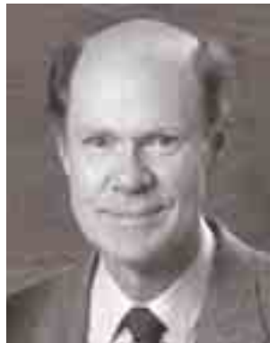
Dr. Robert Woodrow Wilson