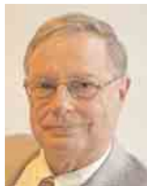
Professor Phillip A. Griffiths

Member of Mathematical Sciences Committee