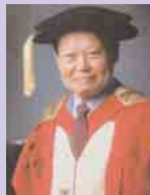
Professor Chen-Ning Yang Member & Chairman, Board of Adjudicators

Professor Chen-Ning Yang, an eminent contemporary physicist, was Albert Einstein Professor of Physics at the State University of New York at Stony Brook until his retirement in 1999. He has been Distinguished Professor-at-large at the Chinese University of Hong Kong since 1986, and Ji-Bei Hoang and Kai-Qun Lu Professor at Tsinghua University, Beijing, since 2005.