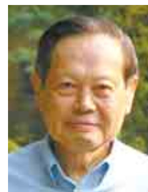
Professor Chen-Ning Yang

Professor Chen-Ning Yang, an eminent contemporary physicist, was Albert Einstein Professor of Physics at the State University of New York at Stony Brook until his retirement in 1999. He has been Distinguished Professor-at-large at the Chinese University of Hong Kong since 1986, and Ji-Bei Hoang and Kai-Qun Lu Professor at Tsinghua University, Beijing, since 2005.