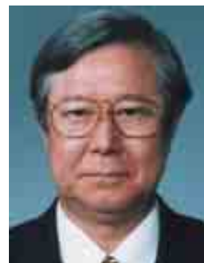
Professor Heisuke Hironaka