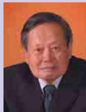
Professor Chen-Ning Yang Member & Chairman, Board of Adjudicators

Professor Chen-Ning Yang, an eminent contemporary physicist, was Albert Einstein Professor of Physics at the State University of New York at Stony Brook until his retirement in 1999. He has been Distinguished Professor-at-large at the Chinese University of Hong Kong since 1986, and Ji-Bei Hoang and Kai-Qun Lu Professor at Tsinghua University, Beijing, since 2005.