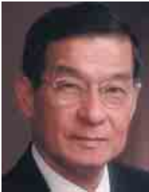
Professor Yuet-Wai Kan Member of Board of Adjudicators Chairman of the Prize in Life Science and Medicine Committee

Professor Yuet Wai Kan is the Louis K. Diamond Professor of Hematology at the University of California, San Francisco. He was born in Hong Kong, graduated from the Faculty of Medicine at the University of Hong Kong and trained at Queen Mary Hospital, Hong Kong, before going to the United States for further studies.