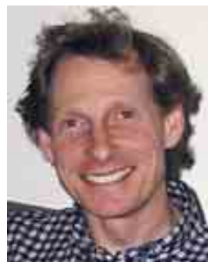
Professor Kim Nasmyth

Member of Life Science and Medicine Committee