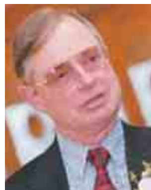
Professor Phillip A. Griffiths

Member of Mathematical Sciences Committee