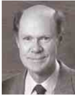
Dr. Robert Woodrow Wilson