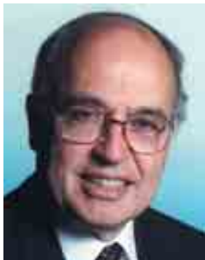
Sir Michael Atiyah Member of Board of Adjudicators Chairman of the Prize in Mathematical Sciences Committee

Sir Michael Atiyah is an Honorary Professor at Edinburgh University. He was previously a professor at Oxford and at the Institute for Advanced Study in Princeton. In the 1990's he was Master of Trinity Cambridge, Director of the Isaac Newton Institute and President of the Royal Society. He was knighted in 1983 and made a member of the Order of Merit in 1992.