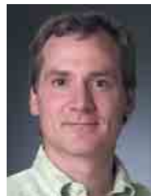
Dr. Marc Tessier-Lavigne

Professor Kim Nasmyth is currently the Whitley Chair at the Department of Biochemistry, University of Oxford. He joined the Research Institute of Molecular Pathology (I.M.P) in Vienna in 1988 and was the Managing Director when he left in 2005. His scientific work has addressed the mechanisms by which genes are turned on and off during development, how DNA replication is controlled, and how chromosomes ensure their segregation during mitosis and meiosis. He has received recognition through several awards, including the Boveri award for Molecular Cancer Genetics (2003), the Croonian lecture/Medal of the Royal Society (2002), the Austrian Wittgenstein Prize (1999), the Louis Jeantet Prize for Medicine (1997), the Unilever Science Prize (1996), and the FEBS Silver Medal (1995). He is a fellow of the Royal Society (1989), a member of the Austrian Academy of Sciences (1999), and a foreign honorary member of the American Academy of Arts and Sciences (1999).