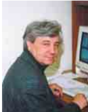
Professor Sergey Novikov

Member of Mathematical Sciences Committee