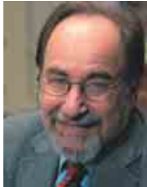
Professor David Baltimore

Member of Life Science and Medicine Committee