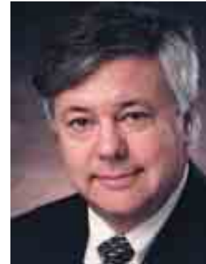
Professor Michael S. Brown

He has received numerous awards including the National Medal of Science.