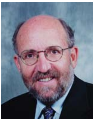
Professor Michel Mayor