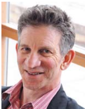
Professor Peter C Sarnak