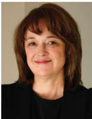
Professor Linda B Buck