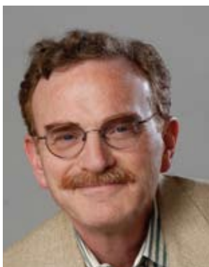
Professor Randy W Schekman