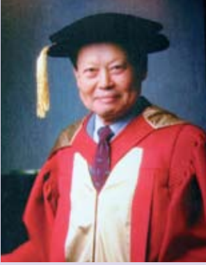
Professor Chen-Ning Yang

Professor Chen-Ning Yang, an eminent contemporary physicist, was Albert Einstein Professor of Physics at the State University of New York at Stony Brook until his retirement in 1999. He has been Distinguished Professor-at-large at The Chinese University of Hong Kong since 1986 and Professor at Tsinghua University, Beijing, since 1998.