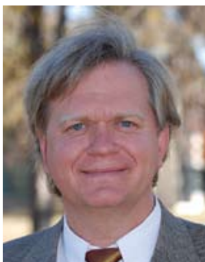
Professor Brian P Schmidt