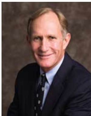
Professor Peter C Agre