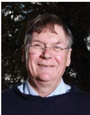
Sir Tim Hunt