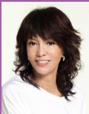
Ms Do Do Cheng

Award Winning Actress and Versatile TV Performer / Programme Host