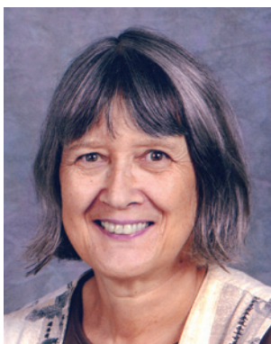
Professor Dusa McDuff