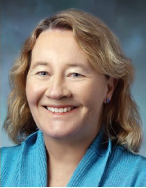
Professor Carol Greider