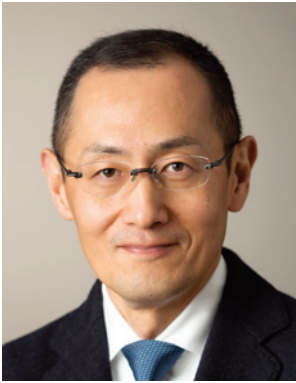
Professor Shinya Yamanaka