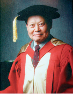
Professor Chen-Ning Yang

Professor Chen-Ning Yang, an eminent physicist, was Albert Einstein Professor of Physics at the State University of New York at Stony Brook until his retirement in 1999. He has been Distinguished Professor-at-large at The Chinese University of Hong Kong since 1986 and Professor at Tsinghua University, Beijing, since 1998.