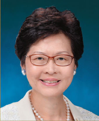
The Honourable Mrs Carrie Lam Cheng Yuet-ngor

spoken for our hopeful possibilities in their contributions to civilization.