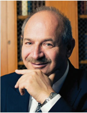
Professor Bruce A Beutler