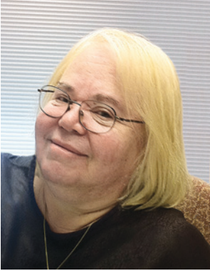
Professor Eve E Marder