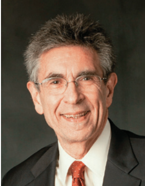
Professor Robert J Lefkowitz