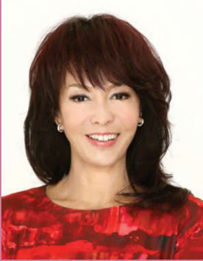
Ms Do Do Cheng

Award-winning Actress Versatile TV Performer Programme Host