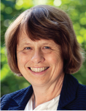
Professor Ewine van Dishoeck