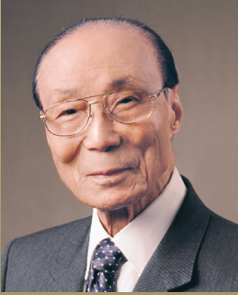
Mr Run Run Shaw

for knowledge is key to sustaining the advancement of civilization, and strengthened his belief that scientists focussed on unmasking the mysteries of nature are pivotal to the well-being of mankind. He decided to use his modest influence, by establishing the Shaw Prize, to inspire and recognize imaginative individuals committed to scientific research and to highlight their discoveries. The Award continues to gain in stature, casting a beam of recognition on outstanding scientific achievements, and firing the imagination of pioneers who follow him in spirit and in deed, sustaining the continued success of the Shaw Foundation and the Shaw Prize Foundation as lasting tributes to his wisdom and generosity.