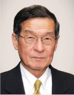
Professor Yuet-Wai Kan

Professor Yuet-Wai Kan is currently the Louis K Diamond Professor of Hematology at the University of California, San Francisco and he focuses his research on the use of gene and cell therapy to treat sickle cell anemia and thalassemia. Professor Kan was born in Hong Kong, graduated from the Faculty of Medicine at the University of Hong Kong and trained at Queen Mary Hospital, Hong Kong, before going to the United States for further studies.