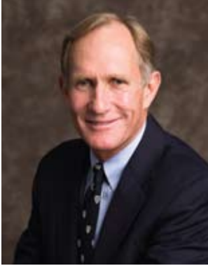
Professor Peter C Agre

Member of Life Science and Medicine Committee