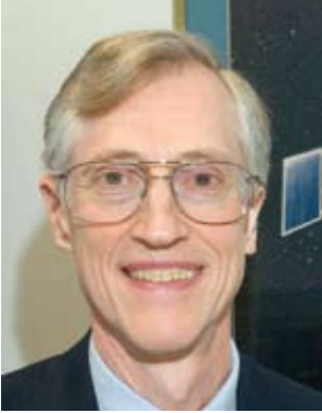
Dr John C Mather Member of Astronomy Committee

Dr John C Mather is Senior Project Scientist for the James Webb Space Telescope at Goddard Space Flight Center, and Chief Scientist of the Science Mission Directorate of NASA Headquarters. His research centres on infrared astronomy and cosmology. He led the proposal for the Cosmic Background Explorer (COBE) and was the Project Scientist, as well as the Principal Investigator for the Far IR Absolute Spectrophotometer (FIRAS) on COBE. He showed that the cosmic microwave background radiation has a blackbody spectrum within 50 ppm, confirming the Big Bang theory. His awards include the Nobel Prize in Physics (2006) with George Smoot.