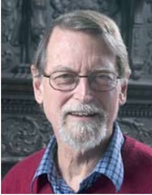
Professor David B Mumford

Member of Mathematical Sciences Committee