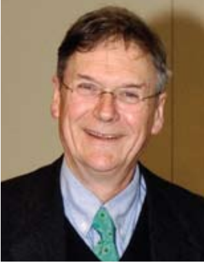
Sir Tim Hunt

Member of Life Science and Medicine Committee