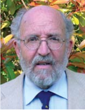
Professor Michel Mayor