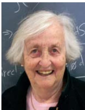
Professor Cathleen S Morawetz

Member of Mathematical Sciences Committee