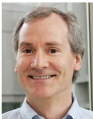
Dr Marc Tessier-Lavigne Member of Life Science and Medicine Committee

Dr Marc Tessier-Lavigne is a world leader in the study of brain development and regeneration. He has pioneered the identification of the molecules, including Netrins and Slits, that direct the formation of connections among nerve cells in the mammalian brain and spinal cord. These mechanisms are also providing essential tools to assist regeneration of nerve connections following trauma or injury, such as paralyzing injuries to the spinal cord.