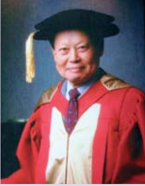
Professor Chen-Ning Yang Member & Chairman, Board of Adjudicators

Professor Chen-Ning Yang, an eminent contemporary physicist, was Albert Einstein Professor of Physics at the State University of New York at Stony Brook until his retirement in 1999. He has been Distinguished Professor-at-large at The Chinese University of Hong Kong since 1986 and Professor at Tsinghua University, Beijing, since 1998.