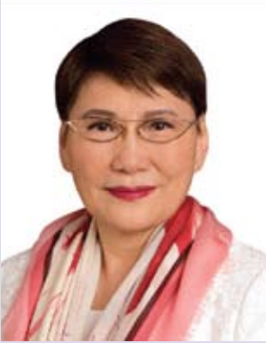
Mrs Mona Shaw Chairperson

Mona Shaw, wife of Sir Run Run Shaw, is Chairperson of The Sir Run Run Shaw Charitable Trust, The Shaw Foundation Hong Kong Limited and The Shaw Prize Foundation. A native of Shanghai, China, she is an established figure in the Hong Kong media and entertainment industry, currently serving as Managing Director and Deputy Chairperson of Shaw Brothers (Hong Kong) Limited and Deputy Chairperson and Managing Director of Television Broadcasts Limited.