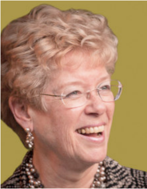
Professor Sandra M Faber