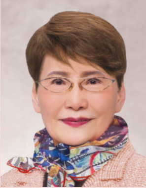
Mrs Mona Shaw (1934 – 2017)

Mrs Mona Shaw uplifted her husband's idea of creating an award to honour and highlight international scientific achievements and together with Mr Run Run Shaw and esteemed academics, brought the concept to fruition with the founding of the Shaw Prize. Advancing the Shaw focus on education, and in the firm belief that the sharing of knowledge is key to discovery, the Prize aims to inform the world's budding scientists of major breakthroughs in diverse scientific fields, and through widely disseminated Shaw Laureate lectures, inspire them to be future trailblazers. Herself a highly respected leader in business, advancing the arts and philanthropy, Mrs Mona Shaw orchestrated the format of the annual Awards Ceremony and her remembered presence is warmly cherished.