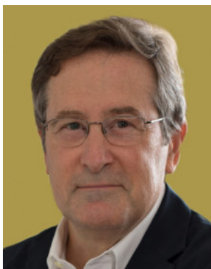
Professor Michael N Hall