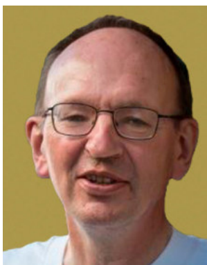
Professor Gerd Faltings