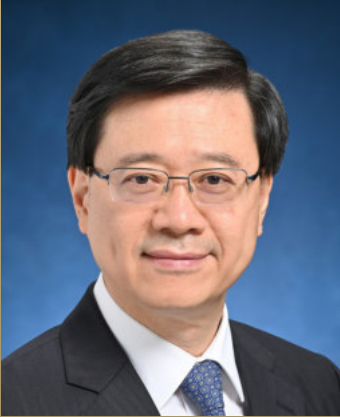
The Honourable John KC Lee

also of the Guangdong–Hong Kong–Macao Greater Bay Area as well as the nation as a whole.