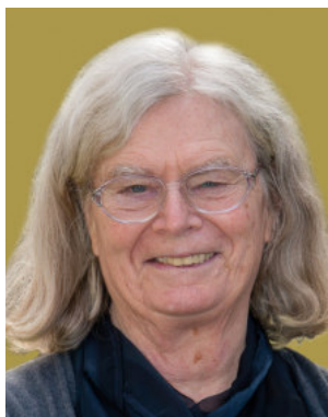
Professor Karen K Uhlenbeck