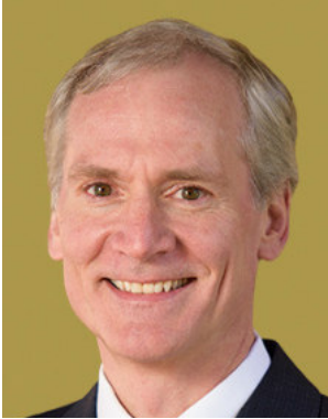
Professor Marc Tessier-Lavigne