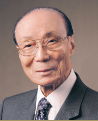
Mr Run Run Shaw (1907 – 2014)