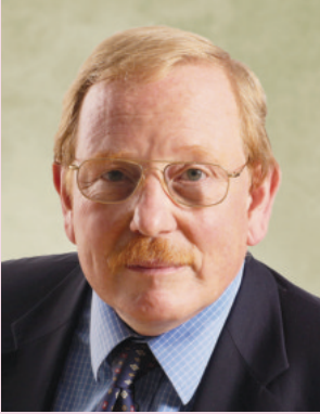
Professor Reinhard Genzel

(also Chair of the Board of Adjudicators)