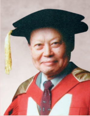
Professor Chen-Ning Yang

Professor Chen-Ning Yang, an eminent physicist, was Albert Einstein Professor of Physics at the State University of New York at Stony Brook until his retirement in 1999. He has been Distinguished Professor-at-large at The Chinese University of Hong Kong since 1986 and Professor at Tsinghua University, Beijing, since 1998.