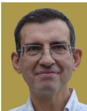
Professor Luigi Ambrosio